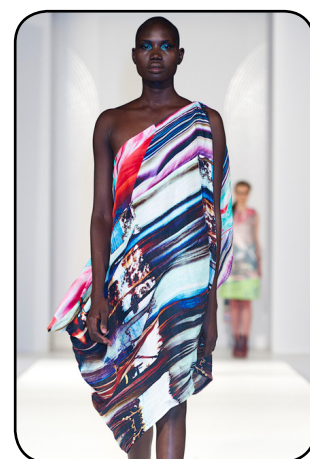
No waste fashion concepts